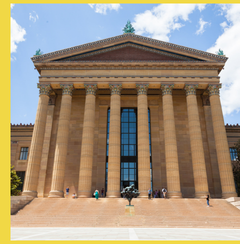
Museum of Art