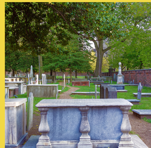
Christ Church Burial Ground