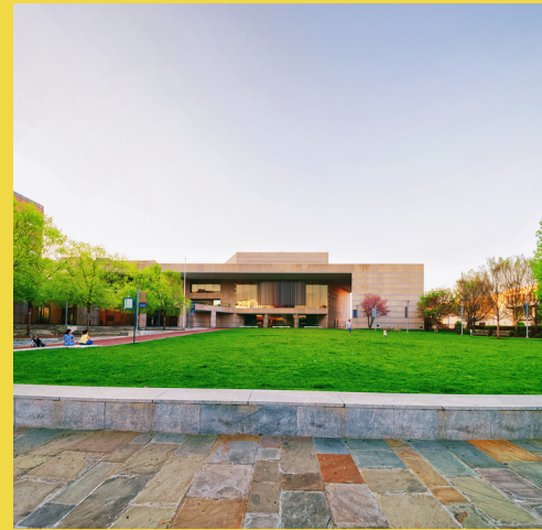
National Constitution Center