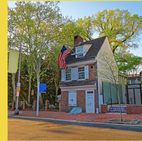
Besty Ross House